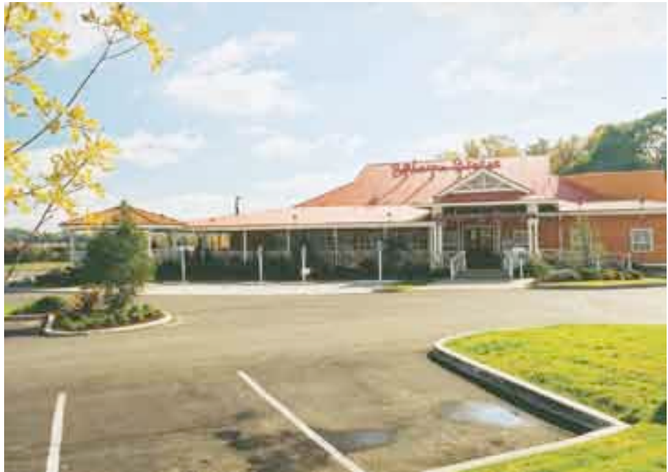
DIVERSE MENU Restaurant clients include Bahama Breeze (above), Brio Tuscan Grille, Champpps, Chili's, Longhorn Steakhouse, Olive Garden, Panera Bread and Quaker Steak & Lube.

In the design/build area, F&W's teams with architects and engineers with design experience specific to the project in determining costs and schedule goals. The advantages of this design/build approach are many. Project budget and costs are determined early, allowing time for appropriate financing opportunities. The team-oriented approach keeps goals in sync and costs down. With F&W's experienced staff, comprehensive value-engineering and alternative material and construction methods can offer added value. With over 25 years of proven experience, the F&W design/build approach has delivered projects on time, on budget and has met client's expectations of quality. Design/build projects