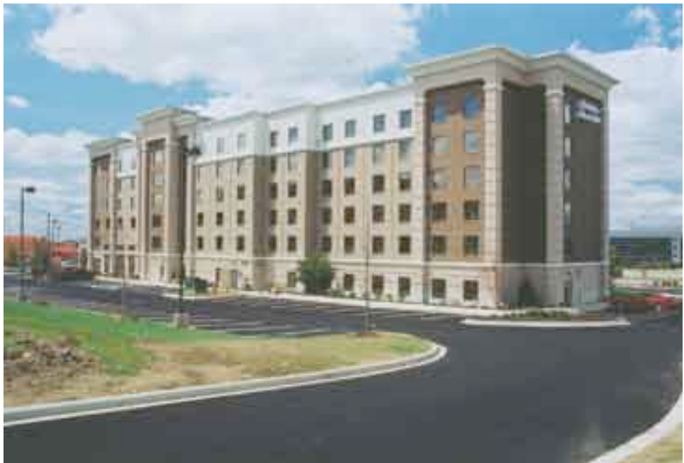
STAYING POWER The company has built thousands of hotel rooms for national clients, including Hampton Inn & Suites (above), Hilton Garden Inn, Courtyard by Marriott and others.

An interesting example of F&W's rollout capability is the recent $45 million conversion of OSCO/SAV-ON into CVS. In eight months, 296 stores nationwide were converted, peaking at 266 carpenters, prewalkers, truck drivers and area leaders on the road simultaneously. Over 400 flights were booked, 44 apartments leased, 415 hotel rooms booked for 17 nights each and truck drivers drove over 75,000 miles