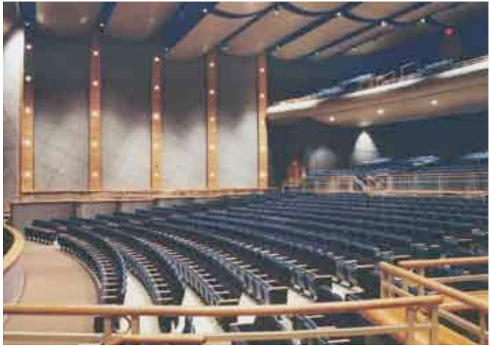
CLASS ACT Institutional clients include Medina High School (above) and Mansfield High School.