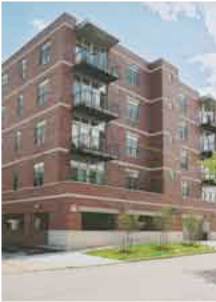
BUILDING ABODES Fortney & Weygandt's multi-family construction projects, include Hunter's Point in San Francisco, Larchmere Lofts in Cleveland (above) and more.

Through the construction phase, project managers and field superintendents lead self-performing crews and qualified subcontractors and suppliers to the successful completion of a project.