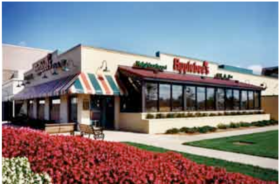
TIMELY SERVICE Fortney & Weygandt, Inc. is proud to open a new restaurant for its clients, such as Applebee’s, every 24 days on average.